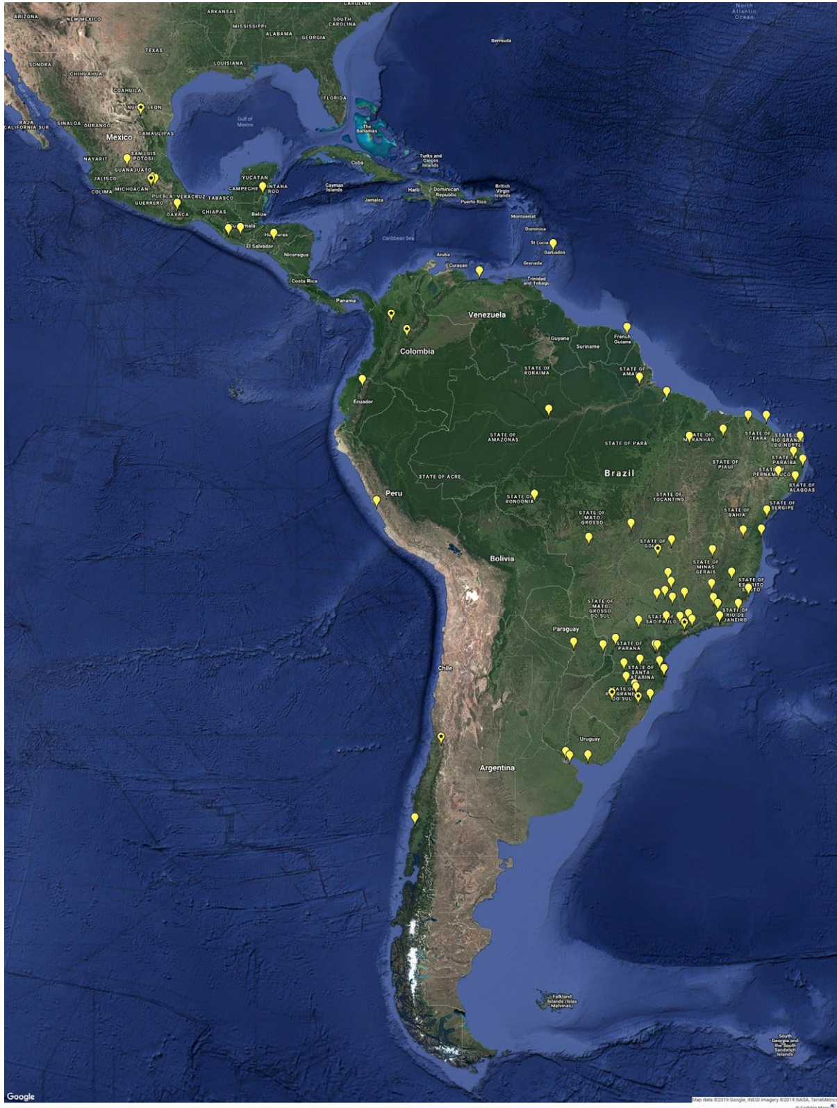
FIGURE 1 Geographic location of centres participating in this survey of diagnostic capabilities in Latin America and the Caribbean. Yellow marks represent institutions that responded to the questionnaire. Yellow marks with a black central star are institutions with the potential to obtain ECMM Blue status by the European Confederation of Medical Mycology (ECMM)